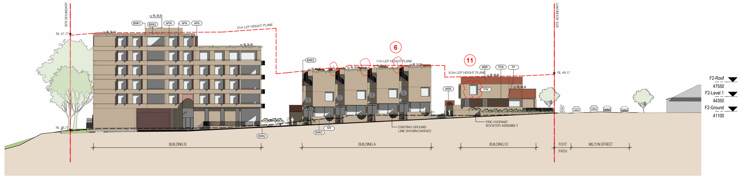
South (New Street)